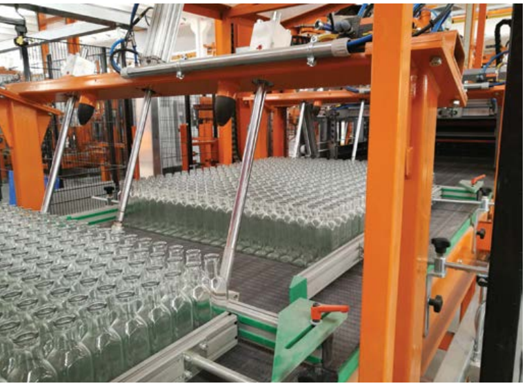
The swivel-arm MSK Triotech palletising system, in combination with the company's Unitech universal head process up to three layers every minute.

With the MSK Multitech shrink-wrapping system, the cold end in Malatya has a compact, high performance and flexible solution. The system is equipped with two film formats and makes it possible to package up to 60 pallets every hour. The compact design with lowerable machine head at the working level and maintenance-free time belt technology allows for simple and quick