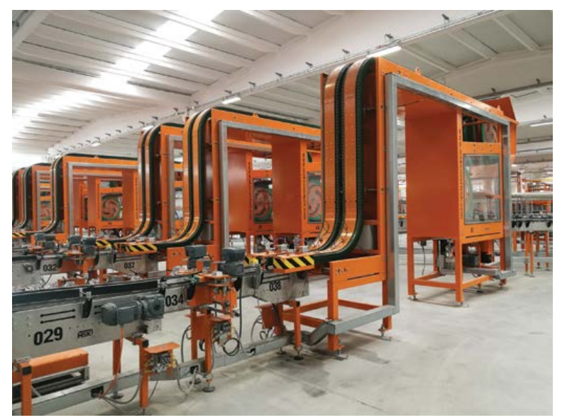
MSK bottle conveyor systems are made from stainless steel and premium components to ensure long life.