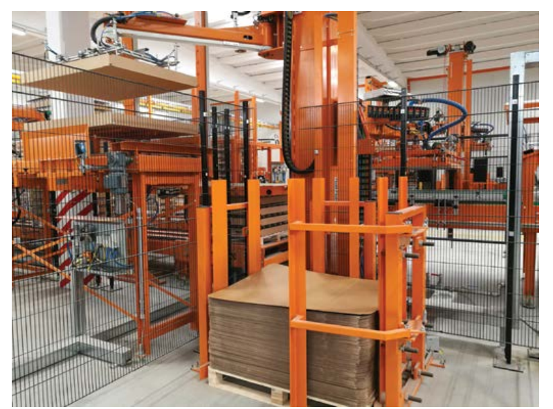
The MSK palletising systems are also equipped with three fully automatic traymakers, a central intermediate sheet inserter and cover sheet/tray inserter, as well as a wooden frame inserter.